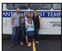
2024 marks 7 years since our survey trip to Tanzania!